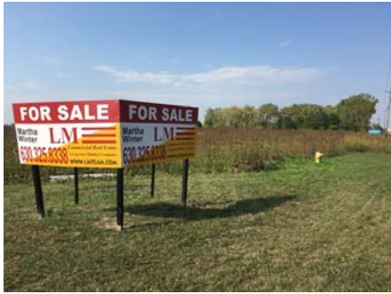
Subject Property View West