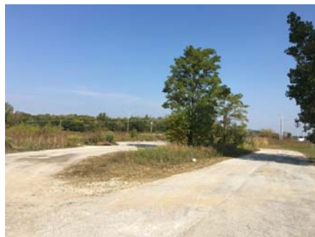
Interior Site View