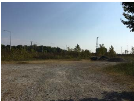
Interior Site View