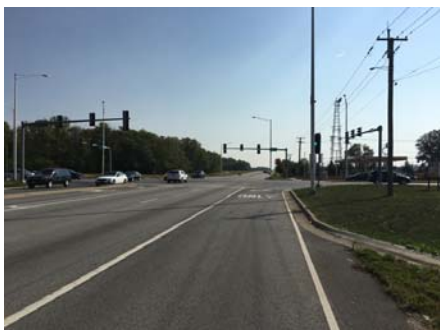
View of West along Vollmer Road