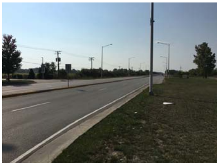
View South along Cicero Avenue