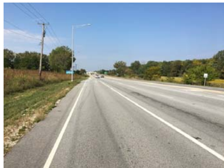
View East along Vollmer Road