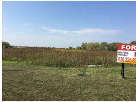
Subject Property View Southwest