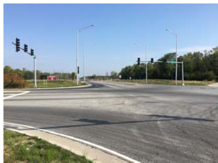
View North along Cicero Avenue